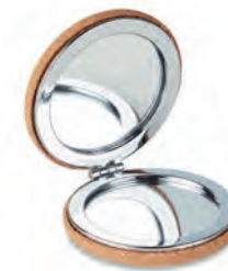
Guapa Cork MO9799 Rounded double sided compact mirror with cork finish cover.