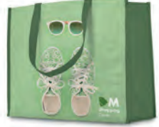
MO4080 MO4080 Horizontal shopping bag with long self material or PP webbing handles.