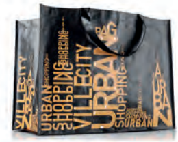
MO4120 MO4120 Horizontal shopping bag with long self material or PP webbing handles.