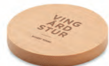
Dakai MO9926 Bamboo bottle opener with coaster function. Bamboo is a natural product, there may be slight variations in colour and size per item, which can affect the final decoration outcome.