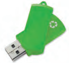
MO1082 MO1082 Rotating mechanism memory stick made in 100% recycle plastic material featuring recycling printed logo.