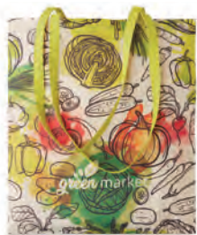
MB8101 (digital) Size: 38(w) x 42(h) cm. Long handle 70 x 2 cm.

Choose from one of our standard sizes or have your bag created in your own custom measurements .