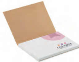
SNES50 SNES50 Recycled soft cover sticky note (size 100x72mm, closed) with 50 sticky notes of recycled white paper (80gsm).