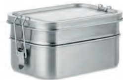
Double Chan MO6212 Stainless steel lunchbox 2 compartments with strong and secure side buckles. Capacity 1200 ml.