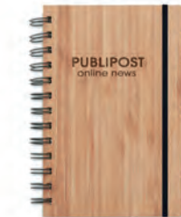
Bambloc MO9435 Bamboo cover notebook with 70 lined recycled paper pages. Includes matching bamboo ball pen with ABS tips and clip.