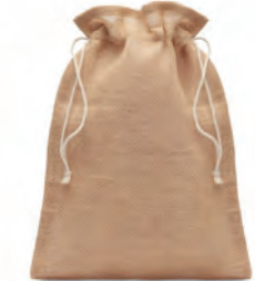
Jute Medium MO9929 Medium gift jute draw cord bag.