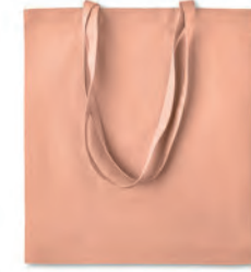
Zimde Colour MO6189 Organic cotton shopping bag with long handles. 140 gr/m 2 .