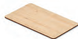
Custos+ MO6200 RFID Anti-skimming card in bamboo case. In this digital era, thieves do not even need to steal your wallet to get to your money or information. By using an electromagnetic field this anti-skimming card makes all 13.56 MHz cards (trains, buses, bank or credit cards) secure from electronic pick pocketing 2-3 cm around the card.