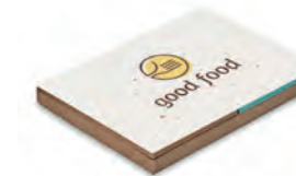
Grow me MO6235 Soft cover memo set with growing paper cover, 25 sticky grass paper sheets and 3 colour page markers. After use a selection of wildflower meadow seeds will grow when planting them in soil.