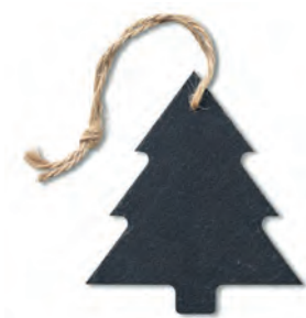
Slatetree CX1433 Slate hanger tree shaped with cord hanger.