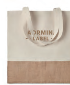
India Tote MO9518 Twill cotton shopping bag with a jute detail. Long handles. 160 gr/m 2 .