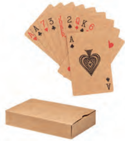
Aruba + MO6201 Recycled paper classic playing cards in a paper box. 54 cards.