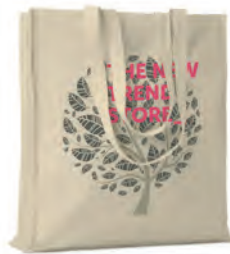
Portobello MO9595 Cotton shopping bag with long handles and gussets. 140 gr/m 2 .