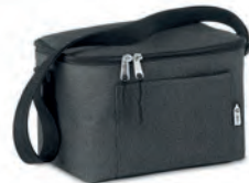
Cuba MO6150 Cooler bag for 6 cans in 2 tone 600D RPET and front pocket. Capacity 3L. Isolation material: 0.15mm PEVA + 3mm foam.