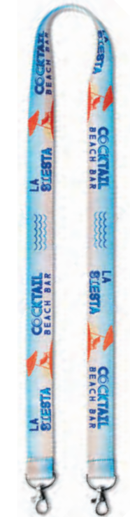
ML1016 Fine Polyester. ML1316 100% RPET.