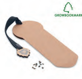
Growbookmark™ MO6226 Give a tree back to the earth with this paper bookmark with cotton rope. Including pine seeds (pinus nigra) which gives a new life to the planet. The tree will grow approx. 30 cm per year. Made in EU.