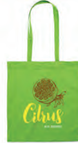
Cottonel Colour + MO9268 Cotton shopping bag with long handles. 140 gr/m 2 .