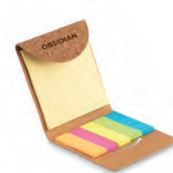
Foldcork MO9858 Cork memo pad 125 yellow pages with 5x25 sticky multi-coloured tabs. 25 pages.