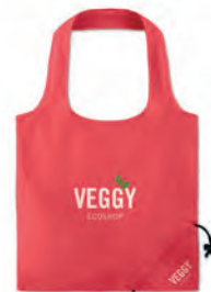
Fresa Soft MO9639 Foldable shopping bag in cotton with short handles with drawstring closure on pouch. 105 gr/m 2 .