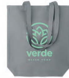
Naima Tote MO6162 100% hemp fabric shopping bag with long handles with gusset in the bottom. 200 gr/m 2 .