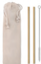
Natural Straw MO9630 Set of 2 reusable bamboo straws, stainless steel-nylon cleaning brush in cotton pouch. Since bamboo is a natural material the thickness and surface can vary.