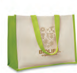
Campo De Fiori MO8967 Jute shopping bag laminated with front in canvas and cotton webbing. Long handles.