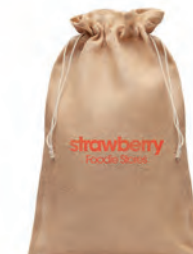
Jute Large MO9930 Large gift jute draw cord bag. Size approx.