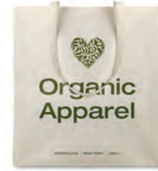
Organic Cottonel MO8973 Organic cotton shopping bag with long handles. 105 gr/m 2 .

In order to know for sure that the cotton is indeed organic, manufacturers go through extensive supply chain verification by third-parties and only certified cotton can be marketed (example by GOTS). The number of organic cotton farms is increasing rapidly, however they still only account for a very small part of cotton production worldwide.