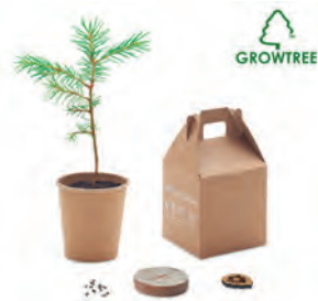
Growtree™ MO6228 Give a tree back to the earth. Including pine seeds (pinus nigra) which gives a new life to the planet. The tree will grow approx. 30 cm per year. Made in EU.