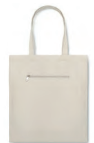
Moura Original MO8634 Canvas shopping bag with short handles and front zipped pocket. 280 gr/m 2 . Produced to the OEKO-TEX standard.