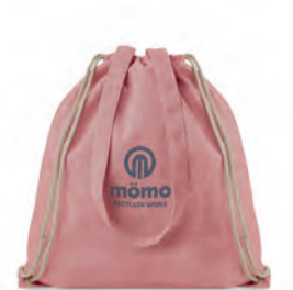
Moira Duo MO9603 2 tone recycled cotton and recycled polyester shopping bag with drawstring and long handles. Approx. 140 gr/m 2 . This item can shrink after printing.