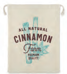
Veggie MO9865 Re-usable food bag. One side is in cotton (140gr/m 2 ) and other one is in mesh cotton (110gr/m 2 ). Drawstring closure.