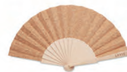
Fanny Cork MO6232 Manual fan in wood with cork fabric sheeting.