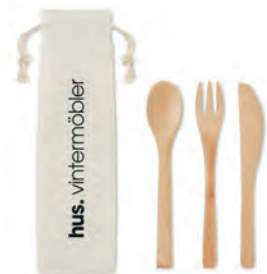
Setboo MO9786 Re-usable bamboo cutlery set in canvas pouch. Includes knife, fork and spoon.