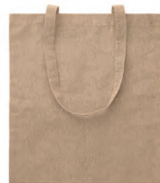
Cottonel Duo MO9424 2 tone recycled cotton and recycled polyester shopping bag with long handles. Approx. 140 gr/m 2 . This item can shrink after printing.