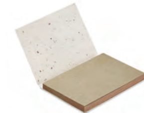
Grow me MO6234 Soft cover growing paper with memo block of 50 sticky grass paper sheets. After use a selection of wildflower meadow seeds will grow when planting them in soil.