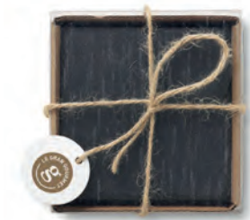
Slate4 MO9124 Set of 4 coasters made of slate with EVA bottom.