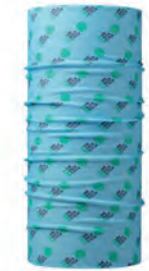
ML3101 ML3101 Recycled PET (RPET) multi scarf.