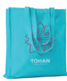
Portobello MO9596 Cotton shopping bag with long handles and gusset. 140 gr/m 2 .