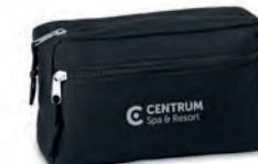
Better & Smart MO6155 Cosmetic bag with double zipper. 600D RPET.