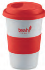
Tribeca MO7683 Single walled ceramic mug with silicone lid and wrap band. 400ml capacity. Not suitable for microwave use. Ceramic transfer is dishwasher safe. As this is a single walled mug heat transfer can still occur.