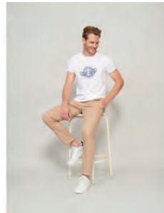
SOL'S EPIC S03564 SOL'S EPIC Unisex T-shirt in organic cotton, ribbed collar, round neck and modern fit, tubular knit. Fabric details 140g/m 2 , single jersey 100% organically grown cotton. OEKO-TEX.