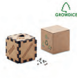
Growdice™ MO6227 Give a tree back to the earth with this wooden dice. Including pine seeds (pinus nigra) which gives a new life to the planet.