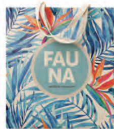
MB8102 Size: 38(w) x 42(h) cm. Short handle 36 x 2 cm.