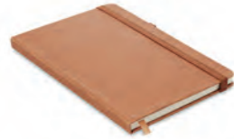
Baobab MO6220 A5 notebook with recycled PU cover and 80 lined pages closed with elastic band and ribbon.