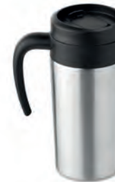
Falun Kopp MO9228 Double wall stainless steel leak free cup with inner PP and handle. Capacity: 340 ml.