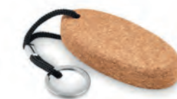
Boat MO6161 Oval floating cork key ring with braided rope.