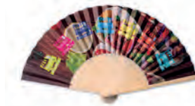
MPFN03 MPFN03 Full colour printing on one side included. Manual hand fan in bamboo with 80gsm paper fabric sheet.