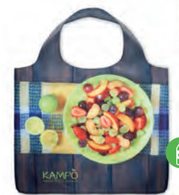
MB1110 XL foldable bag with zippered pouch. 100% recycled PET. Size: 49x60 cm.