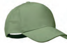
Naima Cap MO6176 5 panel baseball cap in 100% hemp fabric 370 gr/m 2 with brass clips on adjustable strap closure. 5 stitched eyelets in matching colour. Size 7 1/4.