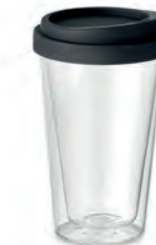
Bielo Tumbler MO9927 Double wall high borosilicate glass with silicone lid. Capacity 350ml.