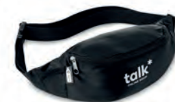
Hulabag MO6213 Fanny bag in 210D RPET with zippered main compartment and adjustable waist strap.