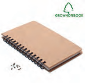
Grownotebook™ MO6225 Give a tree back to the earth with this sustainably paper notebook. 72 lined sheets and spiral. Including pine seeds (pinus nigra) which gives a new life to the planet. The tree will grow approx. 30 cm per year. Made in EU.