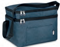
Icecube MO9915 2 tone 600D RPET cooler bag with 2 compartments and PEVA lining. Adjustable shoulder strap and front pocket. Isolation material: 0.15mm PEVA + 3mm foam.