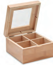
Campo Tea MO9950

Since bamboo is naturally pest-resistant there is no usage of pesticides. Bamboo is a very renewable resource, strong and durable. It absorbs more Co2 from the air and releases more oxygen which improves the air quality. Bamboo is 100% natural and biodegradable.