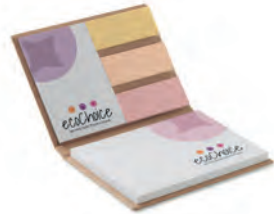
COMBE1 COMBE1 Recycled Hard cover ComboNote (106x77mm, closed) with recycled sticky notes (80gsm) of 100x72mm and 50x72mm; and recycled markers in 3 different colours.