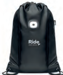
Urbancord MO9970 Drawstring bag in 420D RPET with detachable COB light on the front. Button cell battery included.