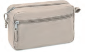
Naima Cosmetic MO6165 Cosmetic bag with double zipper. 100% hemp fabric. 200 gr/m 2 .