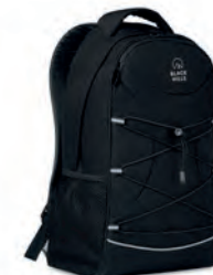
Monte Lomo MO6156 Backpack in 600D RPET with dark cords in front and reflective front panel feature. Mesh pockets on both sides.