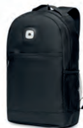
Urbanback MO9969 Backpack in 600D RPET with detachable COB light on the front panel. Front pocket with Velcro closure. Mesh pocket on the side. Button cell battery included.