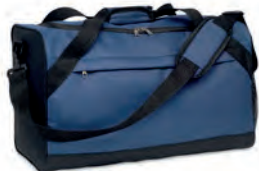
Terra + MO6209 Sport or travelling bag in 600D RPET with large zippered front pocket, inside zippered pocket and adjustable and detachable shoulder strap.