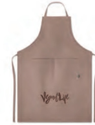
Naima Apron MO6164 Adjustable kitchen apron with 2 front pockets in 100% hemp fabric. 200 gr/m 2 .

This makes it a 100% organic crop and very environmentally friendly. Not only the production process of the hemp fibres is very sustainable, but also due to the fact that these organic fibers are 100% recyclable.