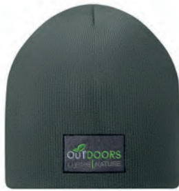
MW1101 MW1101 Double layer beanie. 50% rPET + 50% acrylic, 55 grams.