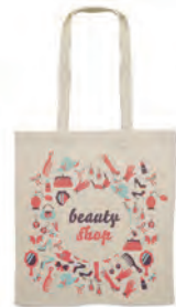
Cottonel + MO9267 Cotton shopping bag with long handles. 140 gr/m 2 .