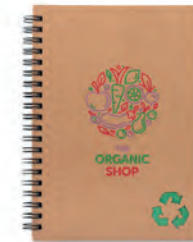
Piedra MO9536 Ring notebook, 70 sheet lined stone paper and recycled carton cover. Stone paper is made from natural stone - calcium carbonate, limestone and HDPE plastic.