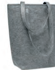
Taslo MO6185 RPET felt shopping bag with long handles and bottom gussets.