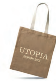
Juhu MO7264 Jute shopping bag with cotton handles.