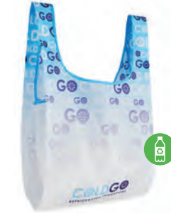
MB1111 Foldable vest shopping bag in 100% RPET with inside pocket. Size: 41x63 cm.