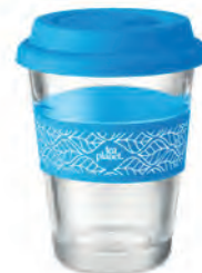
Astoglass MO9992 Glass tumbler with silicone lid and grip. Capacity 350 ml. As this is a single wall mug heat transfer can still occur.