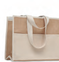
Campo De Geli MO6160 Jute shopping bag with long handles, laminated and with hook and loop closure, front with canvas pocket and cotton webbing.