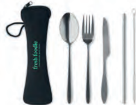
5 Service MO6149 Re-usable stainless steel cutlery set including fork, knife, spoon, straw and brush in neoprene pouch.