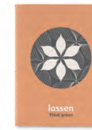
Mini Paper Book MO9868 A6 Cardboard cover (250gr/m 2 ) notebook with 80 stitched recycled pages in 70 gr paper.