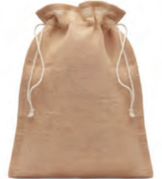
Jute Small MO9928 Small gift jute draw cord bag.