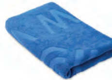
MT4005 MT4005 Relief woven jacquard towels (also known as embossed jacquard) are made of 100% organic cotton in 1 colour (pantone matched).