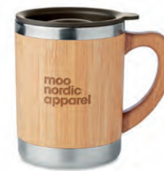
Mokka MO9689 Double wall Stainless Steel tumbler with bamboo case and moveable drink hole. Capacity 300 ml.