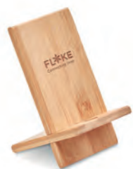
Whippy MO9944 Bamboo phone stand holder. It includes 2 parts, you can assemble it vertically to hold your phone. Bamboo is a natural product, there may be slight variations in colour and size per item, which can affect the final decoration outcome.