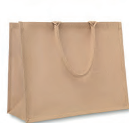
Brick Lane MO8965 Jute laminated shopping bag with cotton paddle. Short handles.