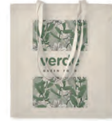
Zimde MO6190 Organic cotton shopping bag with long handles. 140 gr/m 2 .