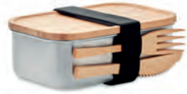
Savanna MO9967 Stainless Steel lunchbox with bamboo lid and 2 cutlery utensils with attachable polyester band. Capacity 600ml.