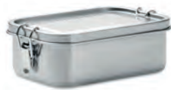
Chan Lunchbox MO9938 Stainless steel lunchbox with strong and secure side buckles. Capacity 750 ml.