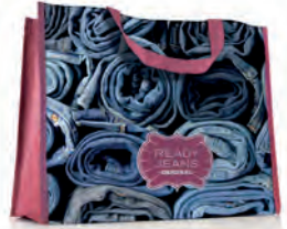
MO4070 MO4070 Horizontal shopping bag with long self material or PP webbing handles.