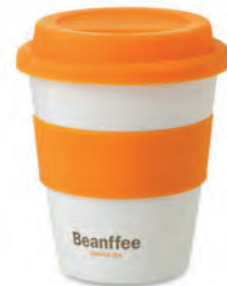
Astoria MO8078 Single wall tumbler in shiny white PP with silicone lid and middle ring. Capacity 350 ml. As this is a single walled mug heat transfer can still occur.