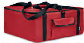
Pizzaway MO6191 Insulated pizza delivery bag in 600D RPET with 1 long adjustable shoulder strap and 2 side handles. It has a PU coating with a waterproof finish. Isolation material: aluminium foil + 6mm foam.