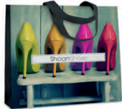
MO4340 MO4340 Horizontal shopping bag with non-woven long handles.