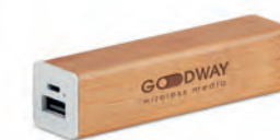
Powerbam MO9673 Power bank 2200 mAh in Bamboo case. Capacity for smartphone use, out put current DC5V/1A. Includes indicating light and USB cable with micro USB plug. Including Type C connector.