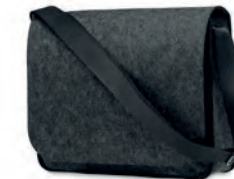
Baglo MO6186 RPET felt messenger or laptop bag with hook and loop closure. Fits a 15 inch laptop.