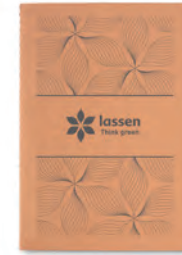
Mid Paper Book MO9867 A5 Cardboard cover (250gr/m 2 ) notebook with 80 stitched recycled pages in 70 gr paper.