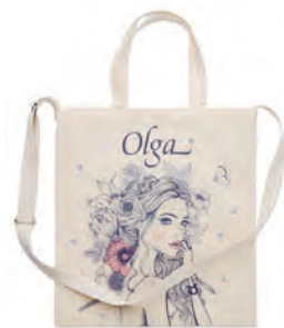
MB8115 Size: 33(w) x 36(h) cm. Short handle 39 x 2 cm. Shoulder strap: 110x2.5cm.