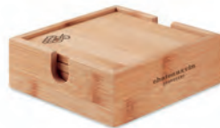
Mendi MO9683 Set of 4 coasters made of bamboo. Presented in a bamboo holder. Bamboo is a natural product, there may be slight variations in colour and size per item, which can affect the final decoration outcome.