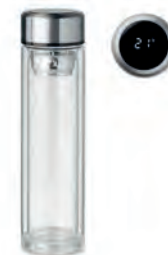
Pole Glass MO6169 Double wall borosilicate glass bottle. It has an LED touch thermometer incorporated in to the top of the lid and tea infuser inside. 1 CR 2450 battery included. Leakproof. Capacity: 390 ml.