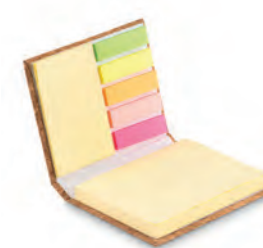
Visioncork MO9855 Cork cover sticky note-pads. Includes 5 sticky multi-coloured tabs and two sizes of repositioning sticky memo pads of 50 pages and 25 pages.