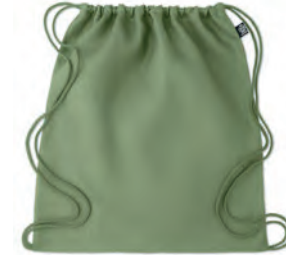
Naima Bag MO6163 Drawstring bag in 100% hemp fabric. 200 gr/m 2 .