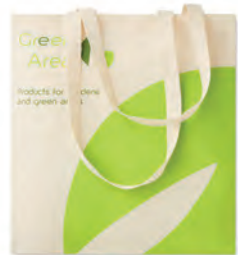
MB8101 (silkscreen) Size: 38(w) x 42(h) cm. Long handle 70 x 2 cm.