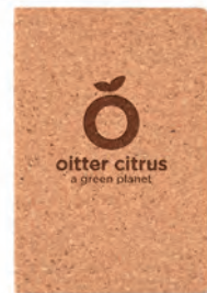
Notecork MO9860 A5 notebook 96 lined sheets with cork soft cover. 60gr/m 2 .

It is a very flexible material and can be processed for production in simple natural way. It has good adhesive properties, making it easy to use in combination with different materials. In general the cork industry is regarded as one of the most environmentally friendly. Cork is 100% natural and biodegradable.