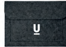
Pouchlo MO9818 Documents bag or 15 inch laptop pouch in RPET felt, 2mm thick, with front pocket and hook and loop closure.