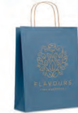
Paper Tone M MO6173 Medium Gift paper bag. 90 gr/m 2 .