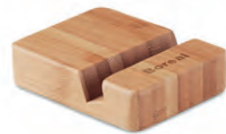
Apoya MO9693 Smartphone stand in bamboo.