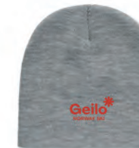
Marco RPET MO9964 Unisex knitted Beanie hat in soft stretchable RPET polyester.