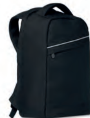
Munich MO6157 600D RPET backpack with padded shoulder strap with main internal compartment. It has a zippered front pocket. Includes one internal 13 inch laptop compartment. Zipper main compartment on backside for better security.