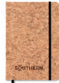
Suber MO9623 A5 notebook 96 lined paper with cork cover, pen loop and elastic band for closure.