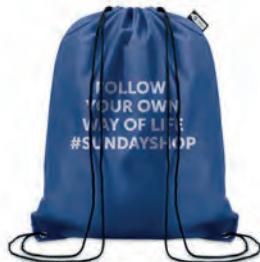
Shooppet MO9440 Drawstring bag in 190T RPET with PP strings. Eco-friendly material made from recycled plastic bottles. Sublimation print available on white item only.