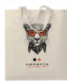
Marketa + MO9847 Cotton shopping bag with short handles. 140gr/m 2 .